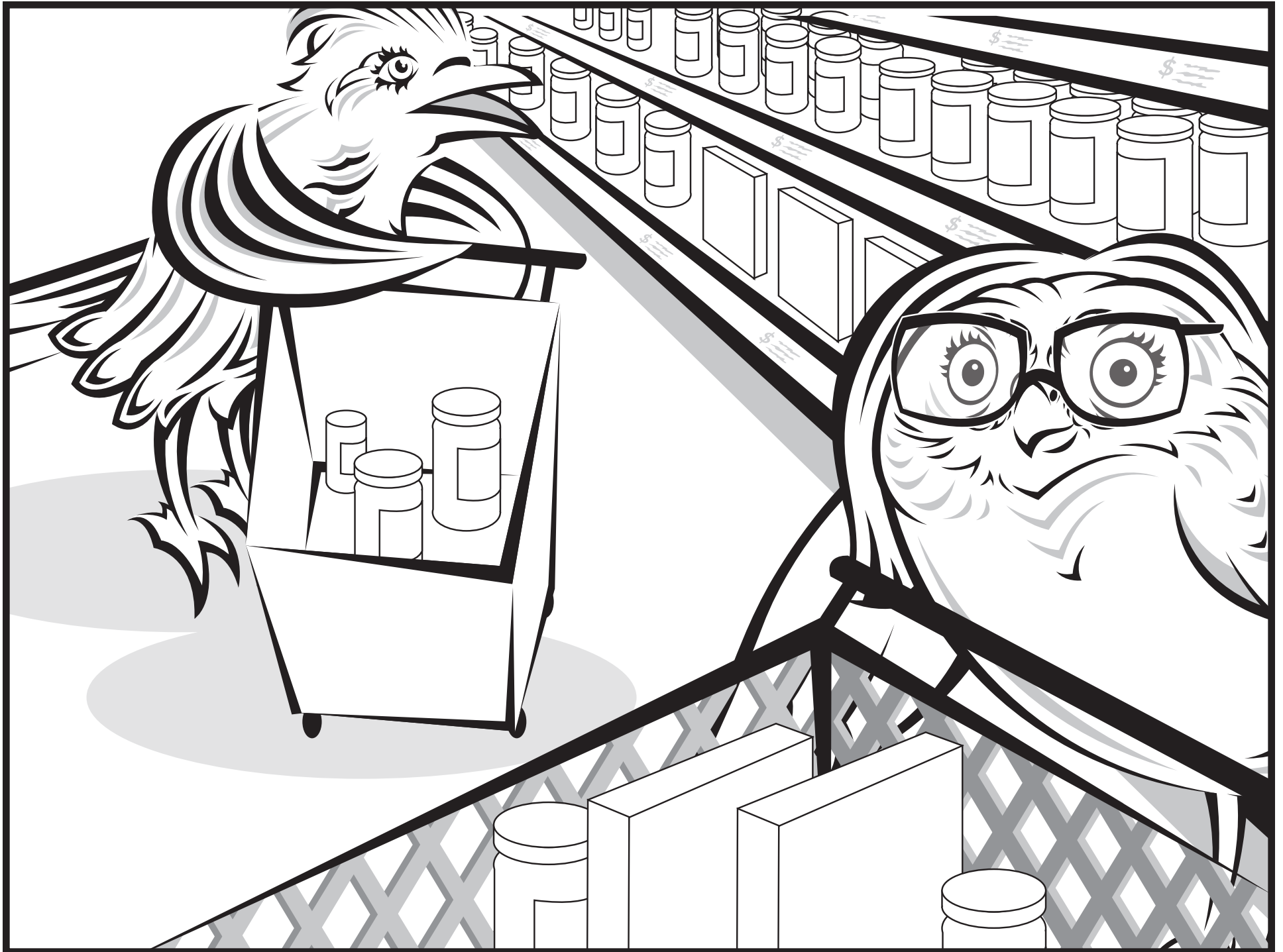
Rhoda Roadrunner dashed down the aisle of the Frequent Flyer Market. She crashed into Olivia Owl, and Olivia and her food flew into the air.