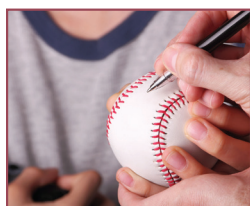
Baseball player signing autograph