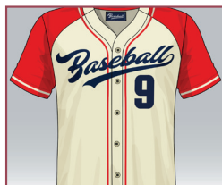
Baseball team jersey