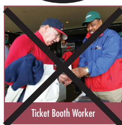
Ticket Booth Worker