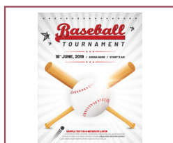
Baseball game poster