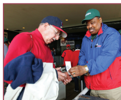
Ticket Booth Worker