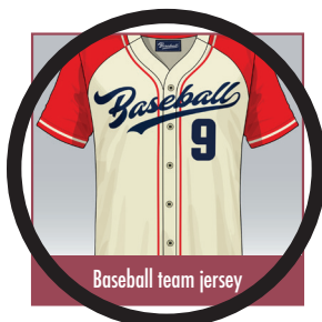
Baseball team jersey