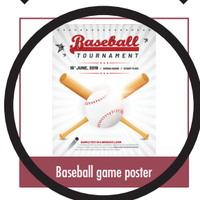
Baseball game poster